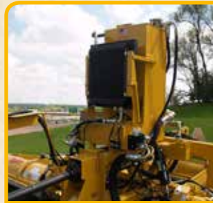
COMPUTERIZED COOLING FAN