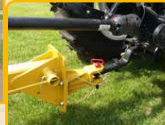
QUICK DISCONNECT DRAWBAR HITCH