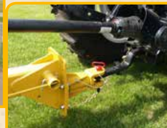
QUICK DISCONNECT DRAWBAR HITCH