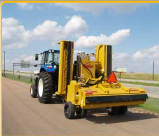
LEGAL WIDTH AND ROAD READY

Built with adjustable tilt switches located on both wing mowers. Set the switch from 0° to 90°, when head is raised to pre-set angle, the mower shuts down so you can move safely over obstacles in your way.