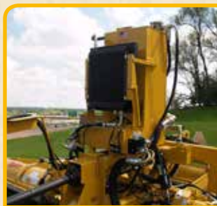
COMPUTERIZED COOLING FAN