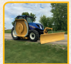
SIDE ROTARY/SNOW PLOW