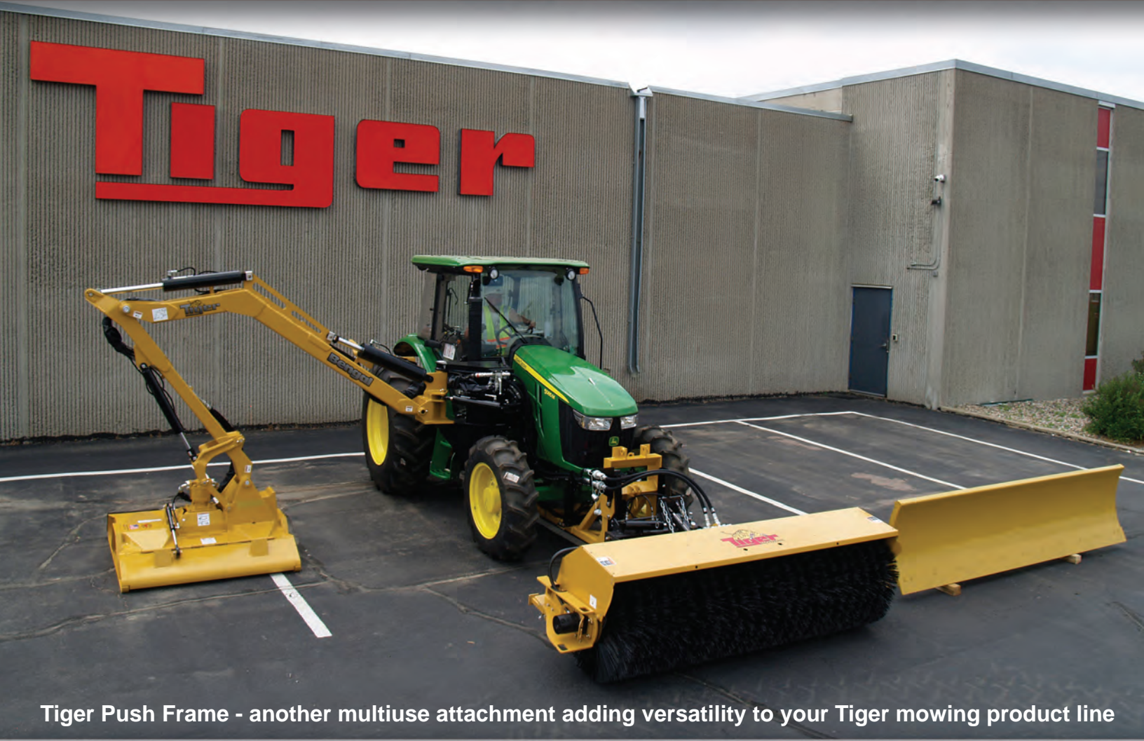
Tiger Push Frame - another multiuse attachment adding versatility to your Tiger mowing product line